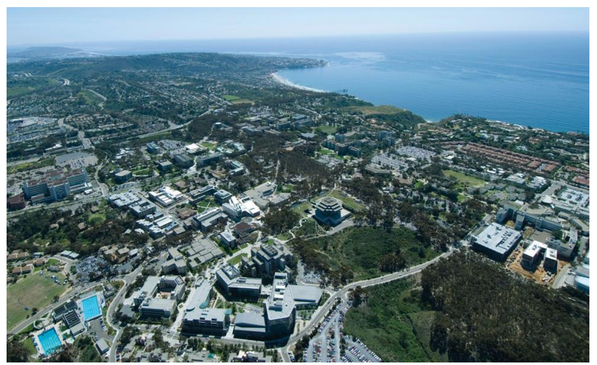
Figure 1—UC San Diego Campus.

Places like Scripps and the Health System on UC San Diego's campus demand a reliable source of electric power. Losing power in these areas, even for a short amount of time, could compromise people's safety and have drastic effects on critical research. This led the university to build their own microgrid so that, even during emergencies, their critical facilities would always have power.