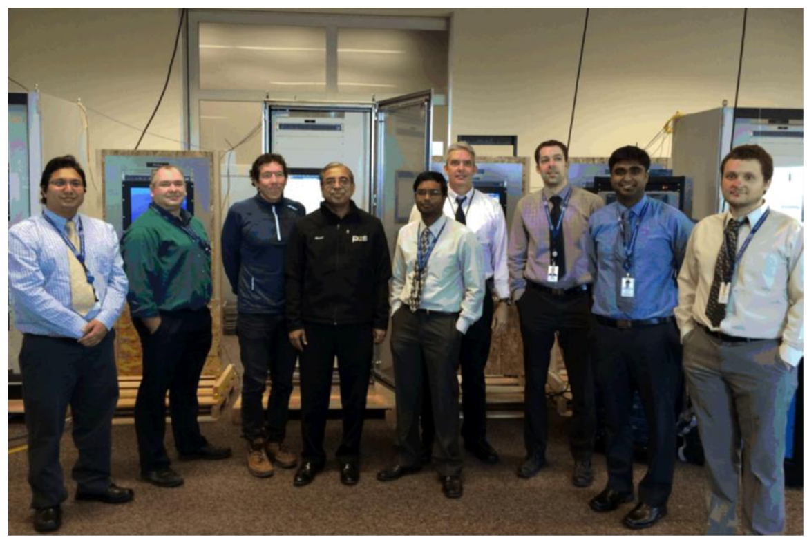
Figure 4—Pullman, Washington. This picture shows the team involved in the FAT for UC San Diego's customized POWERMAX solution. This solution passed hundreds of closed-loop RTDS tests.

Now, not only is their microgrid able to detect unstable power in the main grid and quickly island itself, it is also able to shed noncritical load so that critical areas, like the Health System and Scripps, can maintain reliable operation. In addition, the campus is able to operate reliably at its maximum capacity and potentially save millions per year in energy costs. Partnering with UC San Diego allowed SEL to provide a solution that ensured the safe, reliable, and economical delivery of electric power to the university's critical infrastructure.