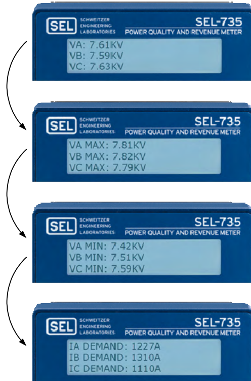
Figure 2 SEL-735 Three-Line LCD Display in Normal Display Mode

Figure 2 shows an example of what the three-line LCD display looks like when the SEL-735 is in normal display mode. The minimum and maximum values show the date and time of an event. These values scroll from right to left when this display is shown. The display update setting (default is 6 seconds) controls how fast the display points rotate through the LCD screen. The user can also scroll through the display values by pressing the {UP ARROW} or {DOWN ARROW} pushbuttons on the front of the meter.