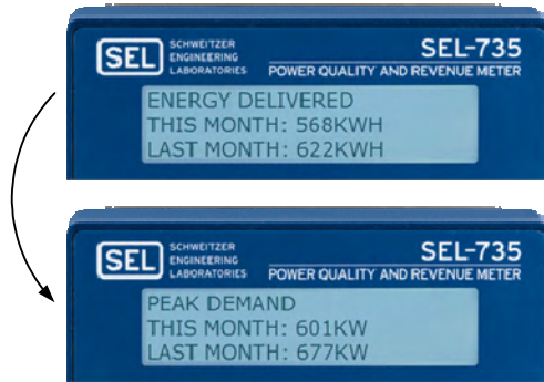
Figure 4 SEL-735 Three-Line LCD Display in Alternate Display Mode

Figure 4 shows the quantities that the SEL-735 displays when the alternate display is active.