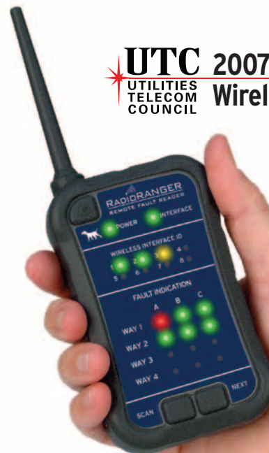
SEL-8310 Remote Fault Reader

UTC 2007 Best UTILITIES TELECOM COUNCIL Wireless Equipment