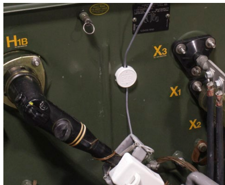
Keep fault indicator cables neat and secure inside pad-mounted cabinets.