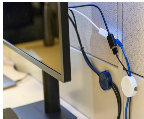
Organize computer cables at your desk.