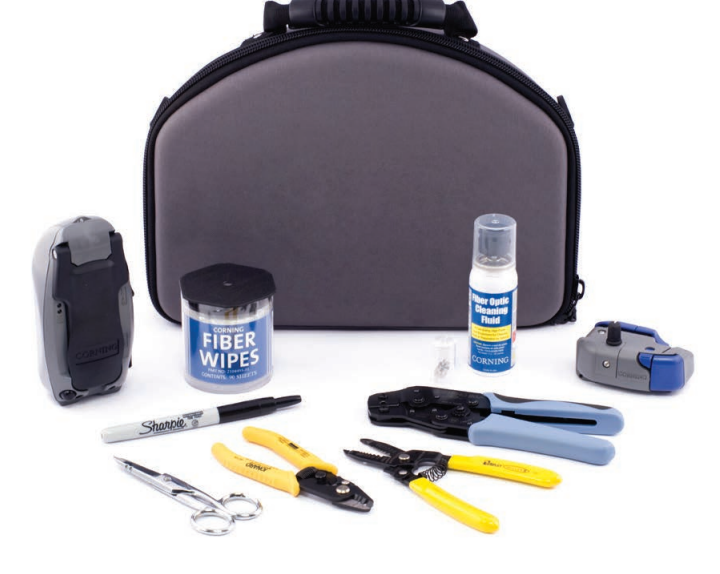
SEL-C809 Fiber Termination Tool Kit Part Number: 240-1540