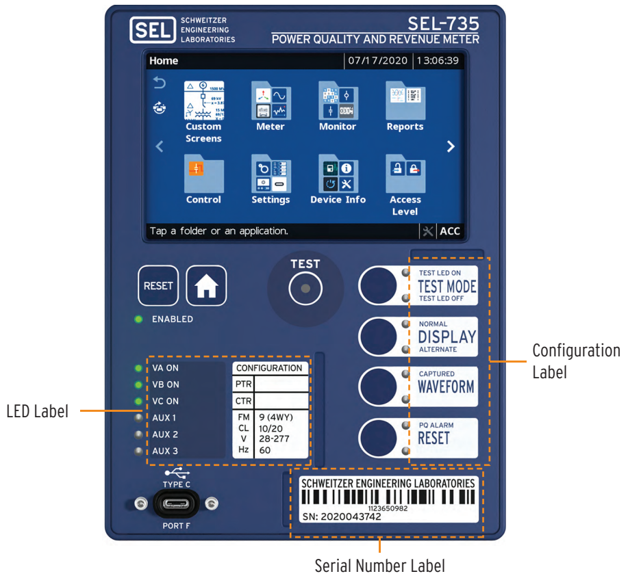
Figure 3 Typical SEL-735 Touchscreen Configurable Label Areas