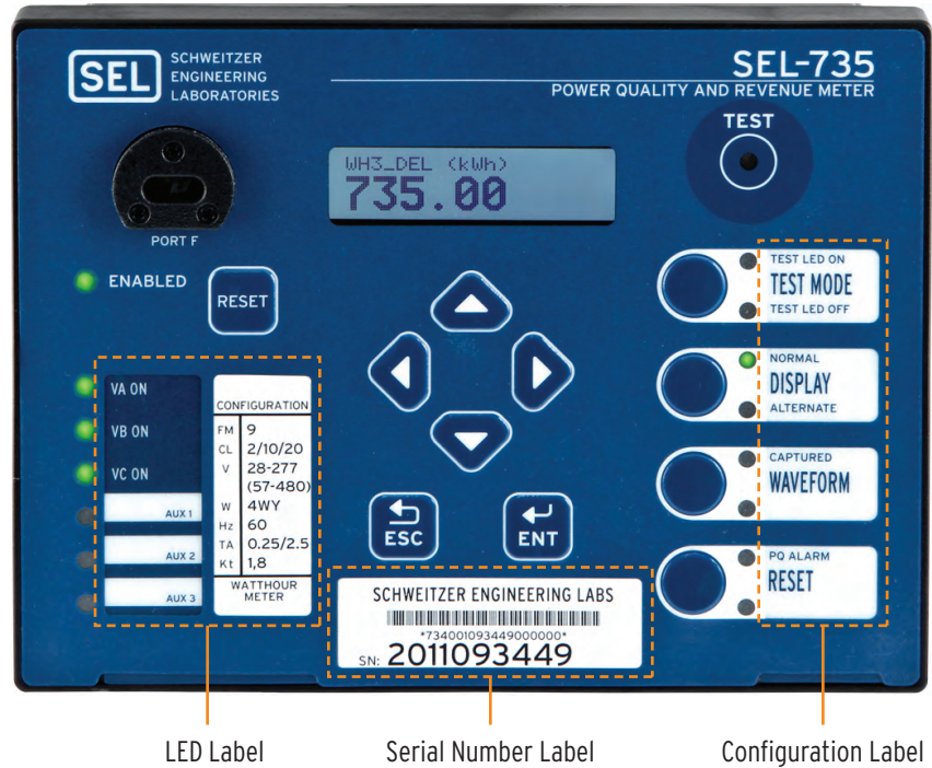
Figure 1 Typical SEL-735 LCD Configurable Label Areas (Horizontal)

The SEL-735 Configurable Labels Kit provides the materials and information needed to customize the target LED and operator control pushbutton areas of the front panel. Figure 1 through Figure 3 show the pocket areas and openings.