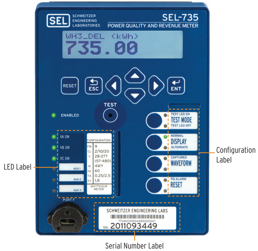
Figure 2 Typical SEL-735 LCD Configurable Label Areas (Vertical)