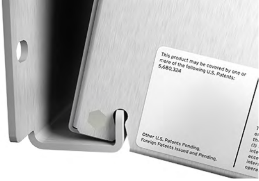
Figure 2 Proper Module Placement

To install the power coupler, tip the top of the module away from the chassis, align the notch on the bottom of the module with the slot you have selected in the chassis, and place the module on the bottom lip of the chassis ( Figure 2 ). The module is aligned properly when it rests entirely on the lip of the chassis.