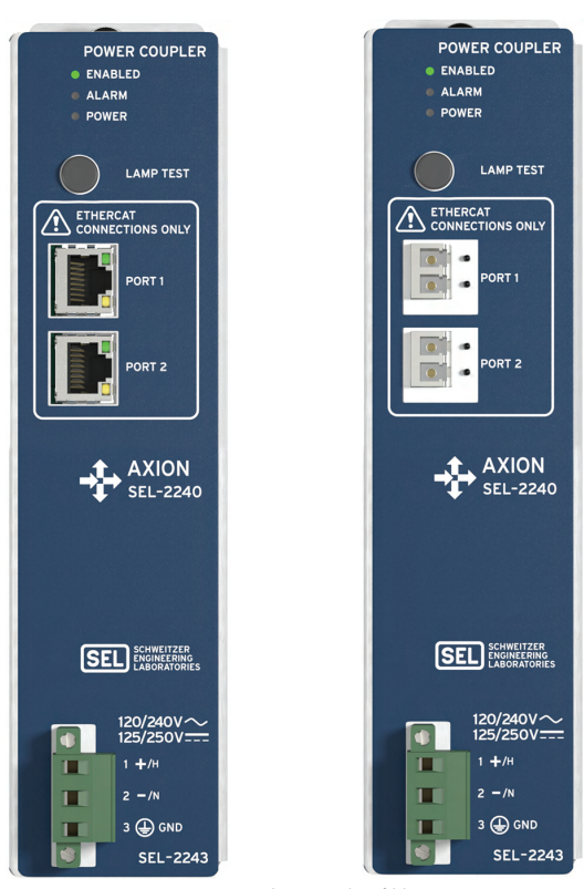
Figure 1 SEL-2243 Front Panel With RJ45 Connectors