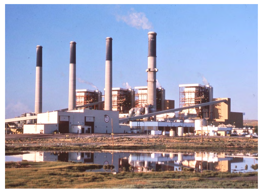
Figure 1 Jim Bridger Power Plant has the fastest triple-redundant system in the world, improving output by 50 percent

Customers today do not need to settle for simply protecting electrical systems and equipment. A RAS lets you proactively change operating and system protection characteristics to minimize the impact of system disturbances, interruptions, and deviations and keep the remaining system as functional as possible. SEL has fast, secure systems in operation at major facilities around the world.