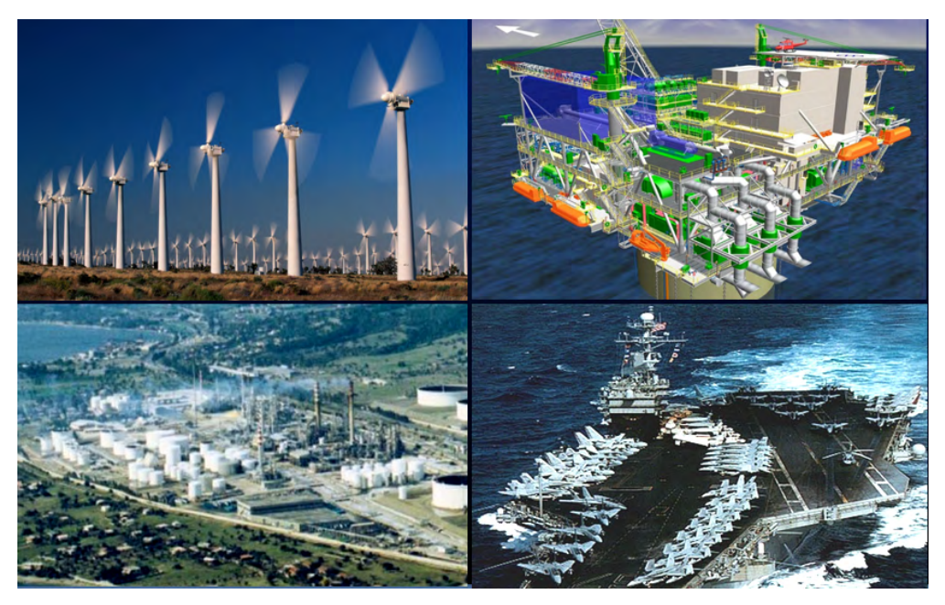
Figure 2 SEL Engineering Services has installed systems on a wide variety of power systems around the world