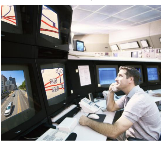
Figure 2 Operator at Local Traffic Center Monitoring Traffic Conditions