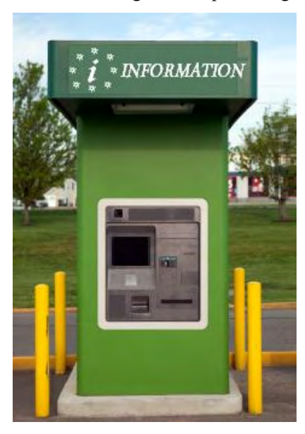
Figure 1 Outdoor Kiosk

Kiosks are used for self-service applications where a user does not have to interact with another person, and the kiosks are expected to be available at all times. Kiosks are located in harsher environments than experienced in office settings and require tough computers.