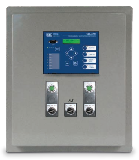
Complete control system built on the SEL-2411 Programmable Automation Controller.

Optional SEL-3010 Event Messenger autodialer and event notification.