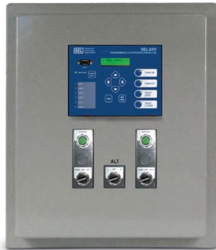
Complete control system built on the SEL-2411 Programmable Automation Controller.