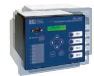
Vibration (15 g Shock)