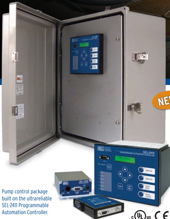
Pump control package built on the ultrareliable SEL-2411 Programmable Automation Controller.

Flexible I/O for automatic control, SCADA, station integration, remote monitoring, and plant control systems.