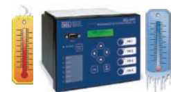
Heat (+85°C) Cold (-40°C)