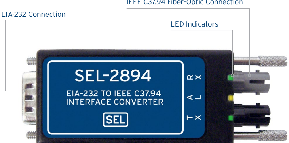
IEEE C37.94 Fiber-Optic Connection

Use the SEL-2894 with any EIA-232 device. The ST connectors accept multimode fiber-optic cables to connect to an IEEE C37.94 optical interface. The SEL-2894 works with SEL relays, other asynchronous EIA-232 devices, and IEEE C37.94-compliant devices.