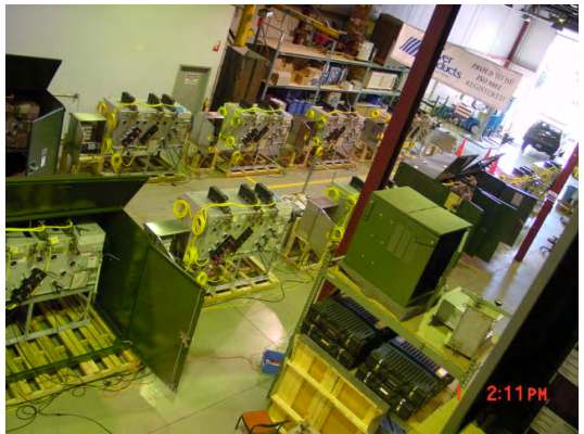
Figure 6—Acceptance testing of the Lake Pontchartrain Causeway power system control is shown above at the Canada Power Products factory.

Drone says that SEL's ACSELERATOR software was quite useful in copying and editing logic statements used at each switch on the bridge and later in testing the switchgear under various simulated fault conditions at Canada Power.