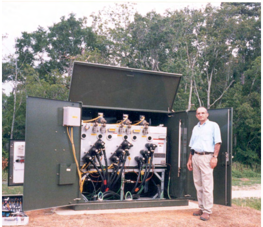
Figure 3—Shown above is the Canada Power Products switchgear installed at the northshore of the Lake Pontchartrain Causeway. Each shore installation is equipped with SF6 Puffer Loadbreak Switch with RFI for fault isolation and sectionalizing between the utilities and the bridge.

At each shore, a Canada Power Products SF6 Puffer Loadbreak Switch with RFI was installed to provide fault isolation and sectionalizing between the utilities and the bridge. Along the bridge, nine other switchgear installations provide fault isolation and restoration. Depending on the specific loading, one or three 3-phase taps protected by RFIs are provided.