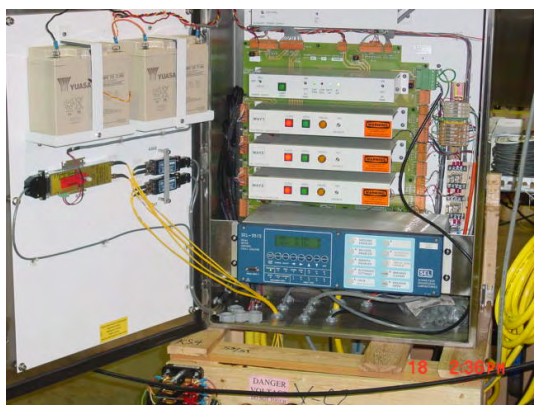
Figure 4—Each switchgear package is equipped with fiberoptic modem/transceiver, current and voltage sensing equipment, and an SEL-351S Protection and Breaker Control Relay.

MIRRORED BITS communications is SEL's patented communications technology for providing high-speed, point-to-point communications of relay contact-status bits, and high-speed bus protection sectionalizing, restoration, and interlock schemes.