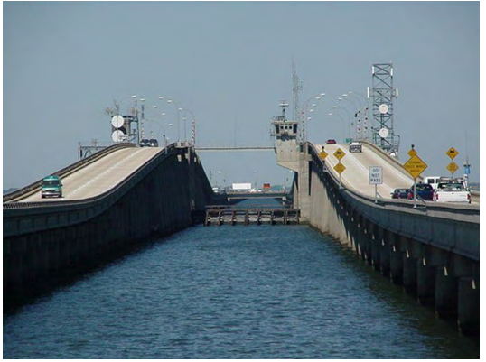
Figure 2—A new electrical system was needed to power drawbridge operation, cell phone towers, toll facilities, and a series of variable-message warning signs to be installed along the, oftentimes fog-enshrouded, causeway.

The Greater New Orleans Expressway Commission (GNOEC), which operates the causeway, initiated a $79 million plan in 1995 to modernize the bridge's infrastructure. A major component of this project was the complete replacement of the high-voltage electrical system, which was inadequate in terms of power and nearing the end of its useful life. A new electrical system was needed to power drawbridge operation, cell phone towers, toll facilities, and a series of variable-message warning signs to be installed along the, oftentimes fogenshrouded, causeway.