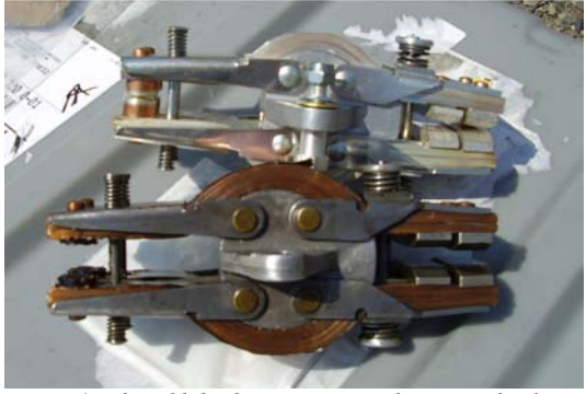
Figure 4—The old bridge contact is shown in the lower portion of this on-site photo. The contacts at both ends are severely worn. The new bridge contact at the top of the photo clearly shows what the contacts should look like.

"In this case, I would say that early analyses of the event record helped prevent a possible transformer fire and a sustained power outage, and also possible damage to the industrial plant equipment from a continued singlephasing condition," Perry said.