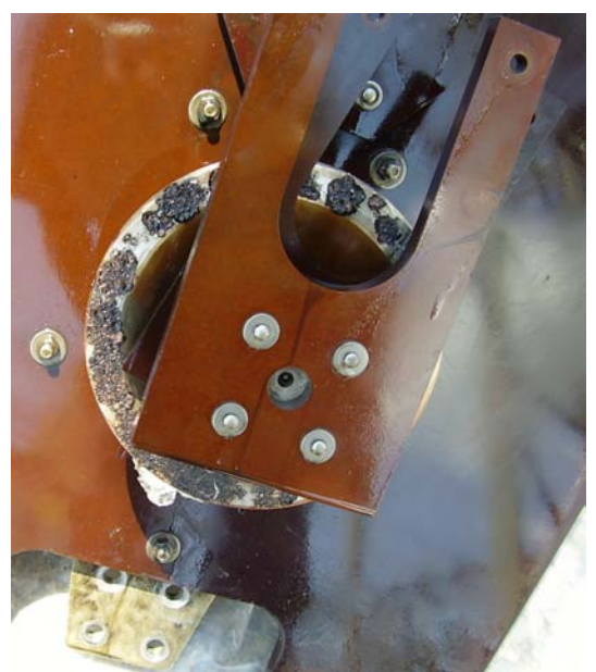
Figure 3—Inspection of the utility transformer revealed the damage caused to the rotor assembly (shown above) and the rotor of the tap changer (shown below) caused by arcing.

Perry said the event records showed a decrease in C-phase current (IC) and C-phase voltage (VC), while A-phase and B-phase currents increased. "This occurred on two feeders. I suggested testing their transformer, which was a tap changer. When we inspected it, we found that the rotary tap changer contacts were severely worn.