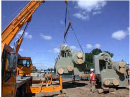
Chiller Unit Installation

Figure 3—Expansive HVAC system supports cooling requirements for the two 24,000-square foot computer rooms.