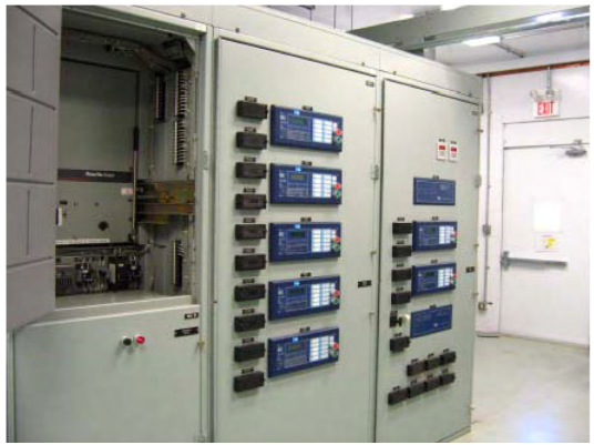
Figure 5—Microprocessor-based relays and other electrical devices are centrally located. Previously, electromechanical relays were used and required one relay per function. With microprocessor-based relays, only one relay is required for multiple functions.

"We didn't have the budget to provide uninterruptible power," Bailey says, "and with a total projected load of 23 MW, there would be no way for us to do that." The Schweitzer Engineering Laboratories, Inc. (SEL) solution met the budgetary and operational reliability requirements.