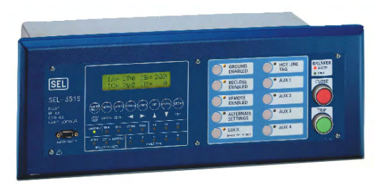
Figure 7—The SEL-351S includes a programmable four-shot auto-reclosing function with synchronism- and voltage-check logic to match a variety of reclosing practices.

The specification of SEL-351S multifunctional relays involved an array of advanced capabilities and features, such as the Sequential Events Recorder (SER) and oscillographic event reports, SEL interface with SEL-2030 Communications Processor, link to SCADA, engineering access, and programmable logic.