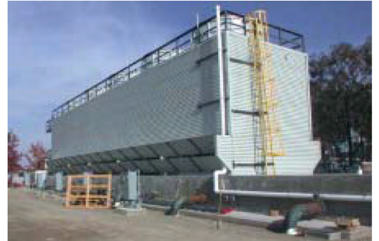
10-MW Cooling Tower