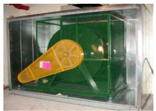
80,000-cfm Air Handling Unit

Typical concerns were that an upstream glitch might cause a fault and that there would not be a safe way to shut down in the event that the cooling system was lost at the 24/7 facility. "We were very concerned that if we have a glitch, how do we safely shut down the chillers. The computers will usually ride through a glitch, but a chiller takes 20 minutes to restart, and the computational calculations are at risk. So then there is redundancy built into the mechanical system as well as the electrical," says Bailey. To further ensure the quality of computations, mechanical loads were separated from computer loads.