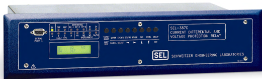
Figure 4—Two SEL-387E Relays are installed to provide comprehensive protection, metering, and event reporting of the power plant step-up transformers.

Major components of the upgrade project include two SEL-387E Relays installed for comprehensive protection, metering, and event reporting of the power plant transformers. Generator protection is provided by two SEL-300G Generator Relays, which also provide important metering and events reporting/recording capabilities plus thermal protection in conjunction with RTDs.