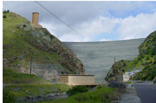
Figure 1—The dam is an earth-and-rock-fill structure, more than 600 feet high and 1,500 feet wide at the crest.

Hydropower, such as that produced at this project, provides stability to the power grid and helps avoid outages due to the loss of a base-load power plant. This reserve hydropower, which can be brought online within a few minutes, provides standby electric generation that keeps the power grid stable. Such plants help compensate for fluctuating power generation and transmission flows that occur during emergencies.