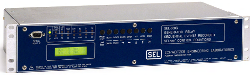
Figure 8—Generator protection is provided by two SEL-300G Relays, which also provide important metering and events reporting/recording capabilities plus thermal protection in conjunction with RTDs.

ble locally and at the main control center located more than 60 miles away.