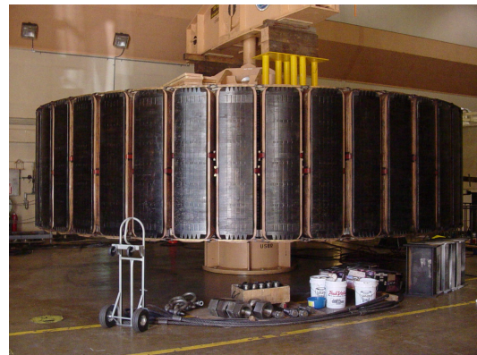
Figure 5—Shown is the 150 MW turbine hydrogenerator.

“The customer chose the SEL-2600A RTD Module because it requires no annual calibration or maintenance and resulting simplification of RTD wiring. A single fiber-optic interconnection between the SEL-2600A and SEL-300G Relay provides all needed temperature data for the alarm and protection capabilities within the SEL-300G Relay,” explains Greg Rauch, SEL application engineer.