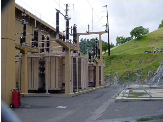
Figure 3—The hydroelectric power plant transformers are protected and monitored by SEL-387E Current Differential and Voltage Relays.

million kilowatt-hours of electricity. The power generated at this peaking plant supports the requirements of the nearby area, with remaining energy marketed through the grid to customers located outside the area.