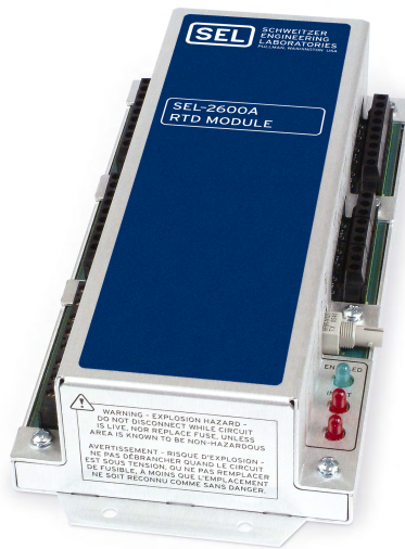
Figure 7—The SEL-2600A RTD Module used for ac power source measures up to 12 RTD temperatures plus one contact input. A fiber-optic link provides electrical noise immunity and ground isolation between devices. The SEL-2600D RTD Module is available for dc power sources.

The original SEL-2600 RTD Module was installed and tested. However, the RTD-connecting cables were not shielded, and the existing RTDs have a much lower signal-to-noise ratio tolerance; therefore, the module could not overcome the noise from the RTD wiring while the generator was under load.