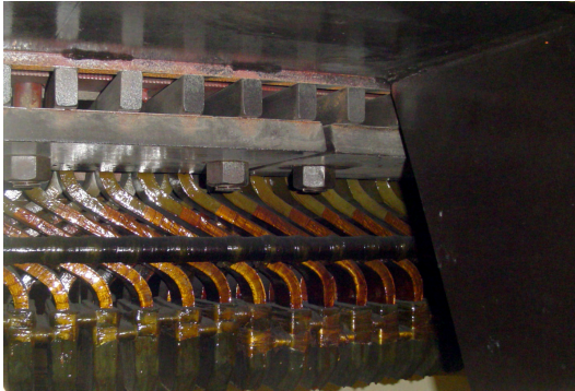
Figure 6—The hot spot was located at the endcaps of the generator stator winding, and the heat radiated toward the RTDs located above.

tion as to what was happening with that RTD. The customer considered changing the RTD being monitored by the existing relay, but decided, instead, to install the SEL technology, which can give alarms and tripping on all RTDs simultaneously,” Rauch explains.