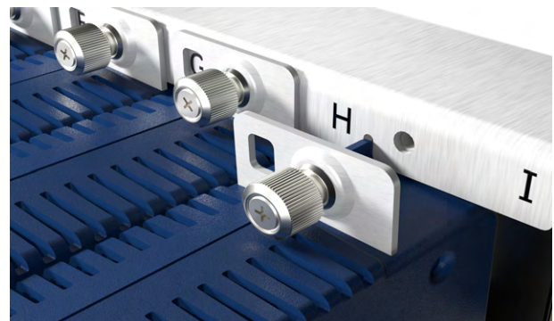
Figure 3 Final Module Alignment

Next, carefully rotate the module into the chassis, making sure that the alignment tab fits into the corresponding slot at the top of the chassis (refer to Figure 3 ). Finally, press the module firmly into the chassis and tighten the chassis retaining screw.