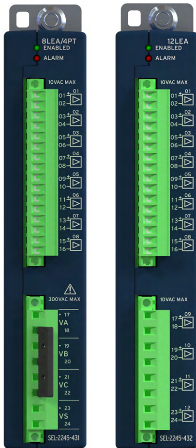
Figure 1 SEL-2245-43 12 Channel Analog Input Module