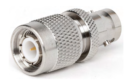
240-1806 TNC Female to BNC Male