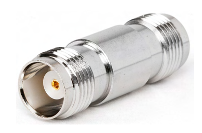
240-1808 N Male to TNC Female