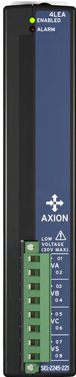
Figure 1 SEL-2245-221 4 LEA Module