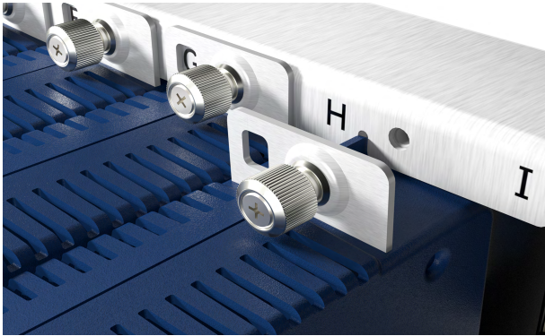
Figure 3 Final Module Alignment

Next, carefully rotate the module into the chassis, making sure that the alignment tab fits into the corresponding slot at the top of the chassis (refer to Figure 3 ). Finally, press the module firmly into the chassis and tighten the chassis retaining screw.