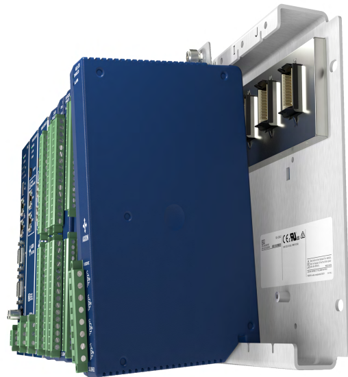
Figure 2 Proper Module Placement

To install an SEL-2245-411 Module, tip the top of the module away from the chassis, align the notch on the bottom of the module with the slot you want on the chassis, and place the module on the bottom lip of the chassis as Figure 2 illustrates. The module is aligned properly when it rests entirely on the lip of the chassis.