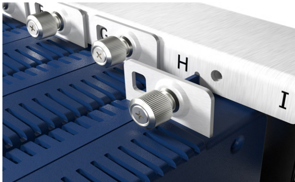
Figure 3 Final Module Alignment

Next, carefully rotate the module into the chassis, making sure that the alignment tab fits into the corresponding slot at the top of the chassis (refer to Figure 3 ). Finally, press the module firmly into the chassis and tighten the chassis retaining screw.