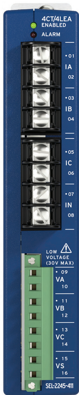
Figure 1 SEL-2245-411 4 CT/4 LEA Module