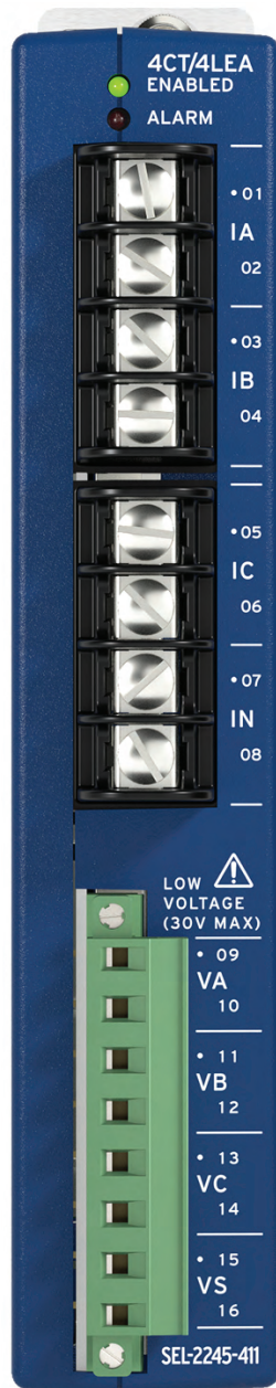
Figure 1 SEL-2245-411 4 CT/4 LEA Module