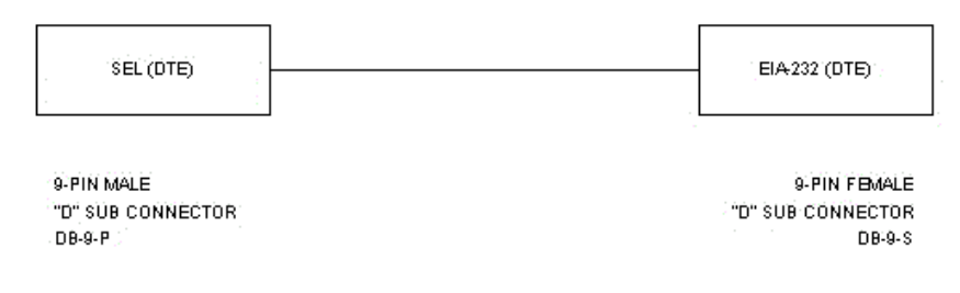
CABLE: 8 Conductor 22 AVVG 7/30 Tinned Copper with PVC Jacket (Shielded: Alpha 1298C or equal)