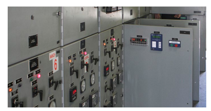
In many upgrades, just 1 or 2 digital relays can replace 20 or more EM relays and provide better protection.

Proactive relay replacement before a device reaches the end of its useful life can help prevent equipment damage and outages resulting from device failures or an inadequate protection scheme.<sup>2</sup> Planned relay obsolescence can also help mitigate complications that arise when regulations or system needs change and can help you stay ahead of the trend of diminishing product support for aging relays.