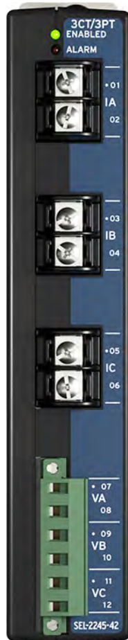
Figure 1 SEL-2245-42 AC Protection Module