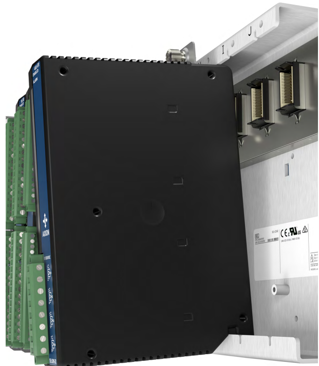
Figure 2 Proper Module Placement

To install an SEL-2245-42 module, tip the top of the module away from the chassis, align the notch on the bottom of the module with the slot you want on the chassis, and place the module on the bottom lip of the chassis, as Figure 2 illustrates. The module is aligned properly when it rests entirely on the lip of the chassis.