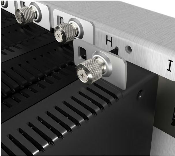
Figure 3 Final Module Alignment