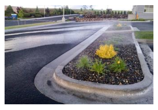
Figure 2—Water Runoff on SEL Zocholl Parking Lot

Using the water consumption data available from the SEL meters (shown in Figure 3), Dennis quickly realized that an irrigation program was running twice per night instead of once. After making a system correction, he was able to reduce the daily water consumption by 32 percent, or 4,000 gallons per day. He was also able to verify that the system was not running on rainy days.