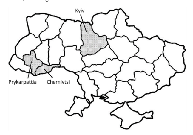
Fig. 1. Regions Affected by the Ukraine Cyber-Induced Power Outage.

Throughout this paper, we will use several terms translated from Ukrainian. The first is обленерго, "oblenergo," which is a regional power distribution entity. It can be combined with a region, such as Київобленерго "Kyivoblenergo," which is the distribution entity for Kyiv and its surrounding area. An область, or "oblast," is a county or region of Ukraine. The Ivano-Frankivsk Oblast, which was affected in the incident, is also sometimes referred to by its traditional name of Prykarpattia. Prykarpattia and Chernivtsi are in western Ukraine, while Kyiv (the capital) is in central Ukraine, see Fig. 1.