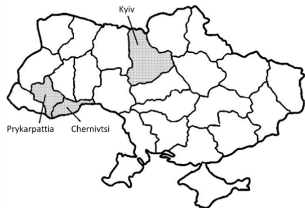
Fig. 1. Regions Affected by the Ukraine Cyber-Induced Power Outage.

Throughout this paper, we will use several terms translated from Ukrainian. The first is облэнерго, “oblenergo,” which is a regional power distribution entity. It can be combined with a region, such as Київобленерго “Kyivoblenergo,” which is the distribution entity for Kyiv and its surrounding area. An область, or “oblast,” is a county or region of Ukraine. The Ivano-Frankivsk Oblast, which was affected in the incident, is also sometimes referred to by its traditional name of Prykarpattia. Prykarpattia and Chernivtsi are in western Ukraine, while Kyiv (the capital) is in central Ukraine, see Fig. 1.