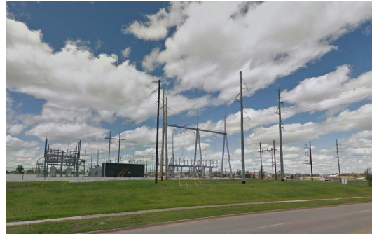
Figure 4—Empire’s newly rebuilt Joplin 26th Street substation

Recovery Award, which recognizes efforts made by electric utilities to restore service breached by severe weather conditions or other natural events.