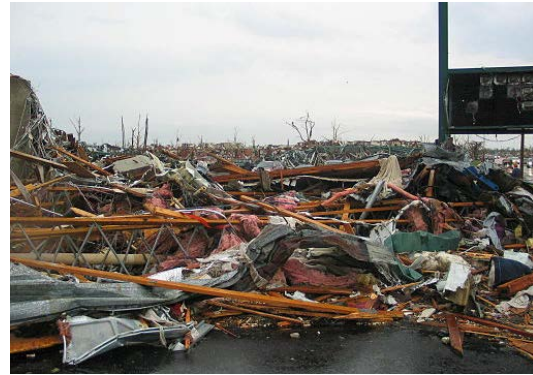
Figure 1—Aftermath of the Joplin EF5 tornado

In the late afternoon of May 22, 2011, a catastrophic EF5 multiple-vortex tornado struck the city of Joplin (Figure 1). Nearly one mile wide and carrying wind speeds in excess of 200 mph, the tornado killed 162 people, making it the deadliest tornado to strike the U.S. in more than fifty years. A local meteorologist described the scene as Joplin having been put into a blender.