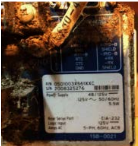
Figure 3—SEL-501 Relay that survived an EF5 tornado

The Empire team placed the relay (Figure 3) in their stores area for use as a spare and turned their attention to the substation restoration process. SEL rolled up their sleeves to help. Construction on the new substation began in early March 2012 and was completed in late October 2012.