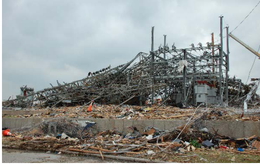
Figure 2—Empire’s Joplin 26th Street substation after the tornado

The Empire team placed the relay (Figure 3) in their stores area for use as a spare and turned their attention to the substation restoration process. SEL rolled up their sleeves to help. Construction on the new substation began in early March 2012 and was completed in late October 2012.