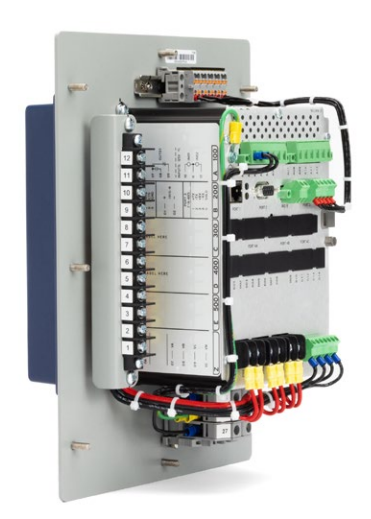
SEL-735 Retrofit Direct-Replacement Assembly for Square D PowerLogic CM2000

Legacy devices with panel cutout dimensions smaller than 7.36 \times 5.47 in (187 \times 139 mm) may require modification to accommodate SEL-700 series relays.