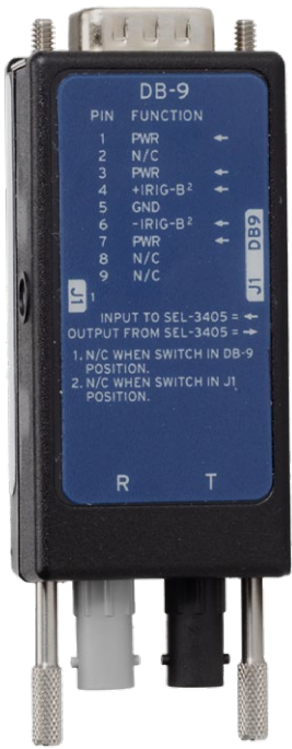
SEL-3405T back label with DB-9 pinout.