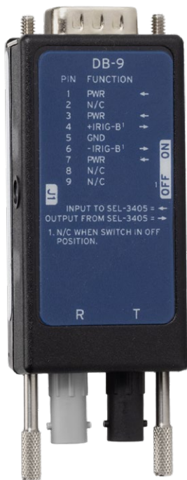
SEL-3405R back label with DB-9 pinout.