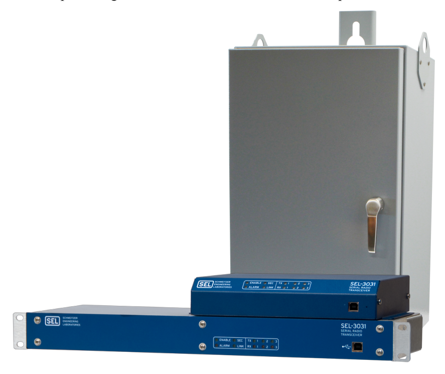
Figure 3 The SEL-3031 provides a communications path between recloser controls

Combine three serial ports into one radio, allowing up to three different connections and protocols to operate simultaneously. The spread-spectrum radio transmits data in the license-free 900 MHz ISM band, providing secure wireless communication for up to 20 miles.