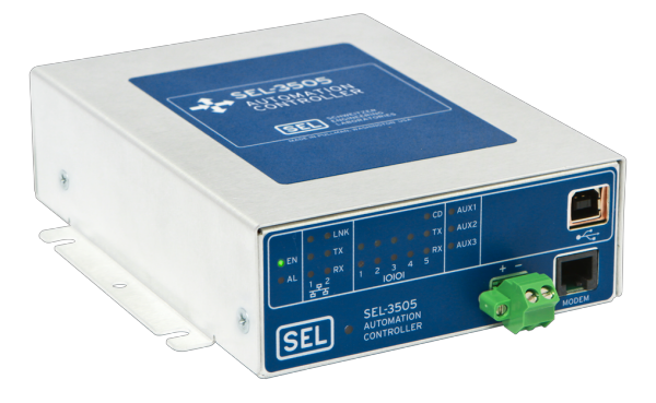
Figure 4 Provide integrated intelligent electronic device (IED) access, monitoring, control, and logging through one reliable system

Make the SEL-3505 the secure access point into your substation or plant using Lightweight Directory Access Protocol (LDAP) central authentication and role-based user authentication, access logs, and secure engineering access. Map security tags into supervisory control and data acquisition (SCADA) reports for industry-leading integration of security technologies.