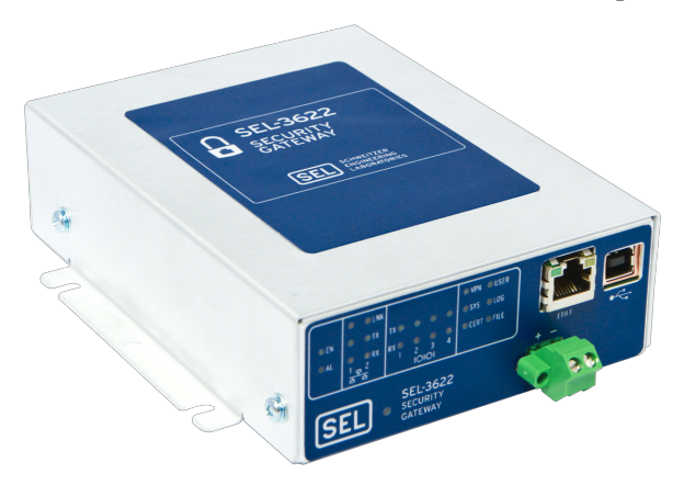
Figure 5 Apply enhanced passwords, minimize privileges per port, and disable unnecessary ports and services for better security with the SEL-3622

Provide a secure access point to an electronic security perimeter (ESP) with the SEL-3622 Security Gateway. The SEL-3622 functions as a router, Internet Protocol Security (IPsec) virtual private network (VPN) endpoint, and secure deny-by-default firewall. It also provides automated password management and proxy services for critical IEDs to help you with your North American Electric Reliability Corporation Critical Infrastructure Protection (NERC CIP) compliance efforts. These features save time with the ability to remotely manage passwords and accounts in cabinet-mounted recloser controls without requiring settings changes or firmware upgrades. Proxy services also provide greater accountability of user actions by tracking all access to IEDs and generating reports that detail who did what and when for each unique device.