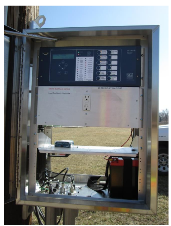
Figure 2—SEL-651R Advanced Recloser Control, SEL-2401 Satellite-Synchronized Clock, and 3G Cellular Modem

Cellular communications allowed Westar to minimize deployment times since there was no back-end infrastructure to build and maintain. Although there were ongoing data charges, data rate plans were negotiated with the cellular provider(s), which offset the costs that would have been associated with a company-owned system. Additionally, the cellular network is continually being built to incorporate new technologies with increasing data throughput rates and decreasing costs of data plans. With the development of new cellular chipsets coupled with embedded microprocessors, IED vendors are beginning to deploy IEDs with integrated cellular modems as an option, some which even harvest power from the very lines they are monitoring, thus minimizing installation time and costs. It is for these reasons that Westar is confident that the move to cellular was the correct decision.