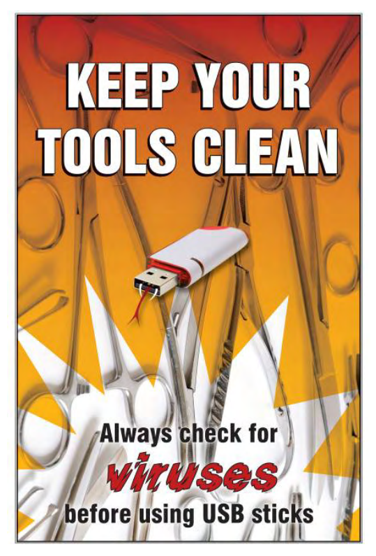
Fig. 1. Convenient USB storage devices can spread malware.

technologies such as whitelisting, regularly updated antivirus, and device control; and limiting administrative rights on control systems will help reduce the risk of USB-spread malware—but do not just assume those controls are enough [12] [13]. There are additional things you can do to help. Visual reminders, such as the poster shown in Fig. 1, encourage people to be cautious when using these devices, particularly in control environments.