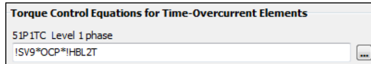
Figure 3 Blocking Fast Curve in the SEL-351RS

The associated Relay Word bit HBL2T should be entered in the torque control equation for the element to be blocked, as shown in Figure 3.