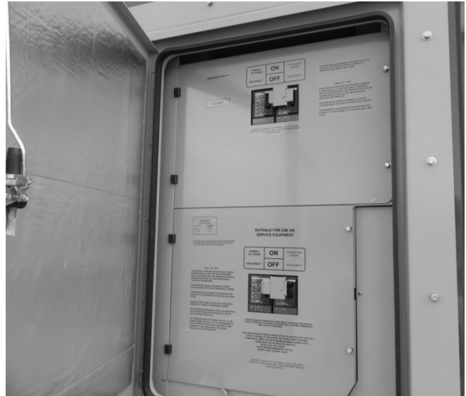
Fig. 3. Load Center/External – Dual AC/DC Source Disconnects

When station power is not available, the trailer-mounted 208/120 Vac, 10 kW generator provides power to the ac load center via a permanently wired, external 100 A receptacle. The generator is equipped with a double-walled base tank sized for more than 48 hours of run time at full load. Additionally, the double-walled base tank allows safe road travel without draining the fuel. Generator alarms are wired to the SYTC for connection to station monitoring equipment. If both station power and the standby generator are unavailable, an exterior weatherproof plug is available for connecting a portable generator.