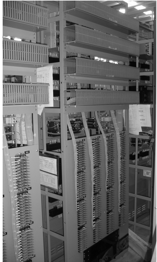
Fig. 5. Protection Panel SYTC Rear View

The MPU provides five protection and control panels that include three switchyard termination panels. A side access panel is provided in the event that a relay panel needs to be changed. Four horizontal Panduits are mounted to the upper rear of each panel to facilitate routing of communications (copper and fiber), ac and dc power, and control wiring. Panel 1 and Panel 2 are wired to the rear SYTC of Panel 2, Panel 3 to the rear of Panel 3, and Panel 4 and Panel 5 to the rear of Panel 4, as shown in Fig. 5. The wiring configuration reduces space requirements by eliminating the need for an external cable tray, allowing the use of switchboard wiring in lieu of jacketed cable.