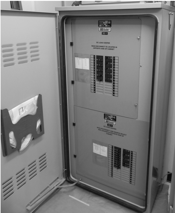
Fig. 2. Load Center/Internal – AC/DC Distribution Panels

The ac/dc load center is built into the exterior wall to provide dual access: interior for ac and dc distribution panels and exterior for main disconnects and lugs. Fig. 2 displays a typical dc distribution panel at the top and ac distribution panel at the bottom. In the event of an electrical short in the relay panels (dc) or enclosure wiring (ac), exterior access to the main disconnects allows power to be safely disconnected without exposing personnel to risk (see Fig. 3). Furthermore, exterior access to the main lugs allows easy connection to station power at the bottom of the load center (not shown), and a removable doghouse provides weather protection. Lugs and main circuit breakers are available for primary (Source 1) and auxiliary (Source 2) ac and dc power sources. Mechanical interlocks between the circuit breakers prohibit accidental paralleling of sources.