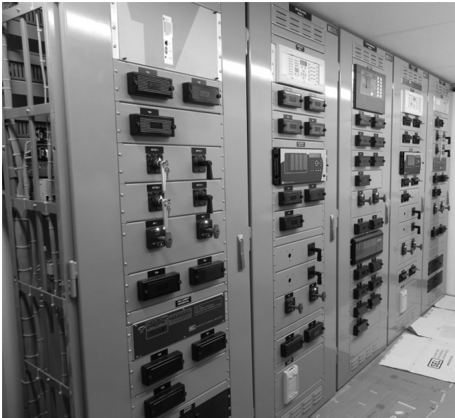
Fig. 6. Protection Panels 1 Through 5 Front View

remote terminals. AC sensing and dc control circuits are wired to the SYTC for easy connection to yard cables. All sensing circuits are utilized, and spare control circuitry is wired to provide maximum versatility. Microprocessor-based relaying provides the capability of having multiple protection schemes with preprogrammed logic, multiple input monitoring, multiple output tripping, and diverse communications. Test switches are utilized to provide isolation of all currents, voltages, inputs, and outputs for connections between the yard and the relay enclosure. See Fig. 6 for a view of the Panel 1 through Panel 5 layout.