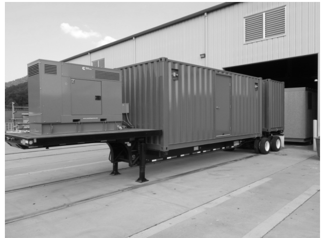
Fig. 7. Completed Trailer View

New York City Department of Transportation requirements limit the overall trailer dimensions to 40 ft long by 8 ft wide. Larger sizes require special permits for travel on city streets. The substation yard clearance requirements of Con Edison limit the height to 12.5 ft. The MPU uses a special trailer with low-profile wheels to meet the height clearance requirements. In addition, it provides easy access to the front door and SYTC access doors. Dolly legs allow separation from the tractor and leveling control. See Fig. 7 for a side view.