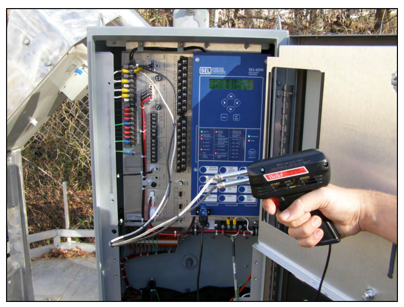
Figure 1 Soldering Gun Connections

the soldering gun by loosening the hexagonal screws. A short clip lead was connected to each post, as shown in Figure 1.