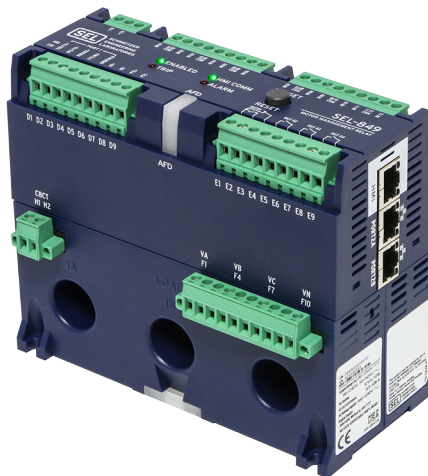
Figure 1 The SEL-849 Motor Management Relay

The relay (shown in Figure 1) is designed to operate in extreme conditions, with an operating temperature of -40^{\circ} to +85^{\circ}\text{C} ( -40^{\circ} to +185^{\circ}\text{F} ). It is also designed and tested to exceed all applicable standards, including vibration, electromagnetic compatibility, and adverse environmental conditions.