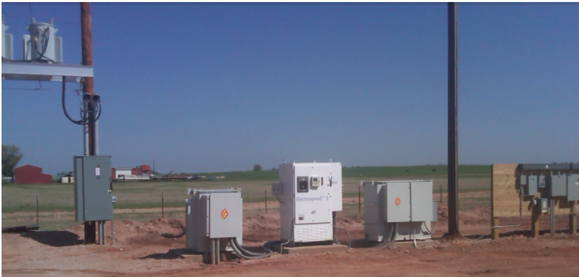
Figure 2 A Typical Wellhead and Tank Battery Electrical Supply System

VFD controls and protection can be sensitive to voltage dips and power quality problems. When a wellhead goes offline, it is critical to determine why very quickly. Without a permanently installed data recorder, it is common for temporary data recording devices to be installed to troubleshoot and determine root cause. Because oil fields can be quite large, this can mean many hours and thousands of dollars spent to install a temporary device after the event has occurred, with the hopes of capturing a similar event in the future.